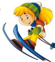
Snow in Love - Princess Snowflake.

All and all, it was a beautiful day. Thanks to everyone who attended for making it so.